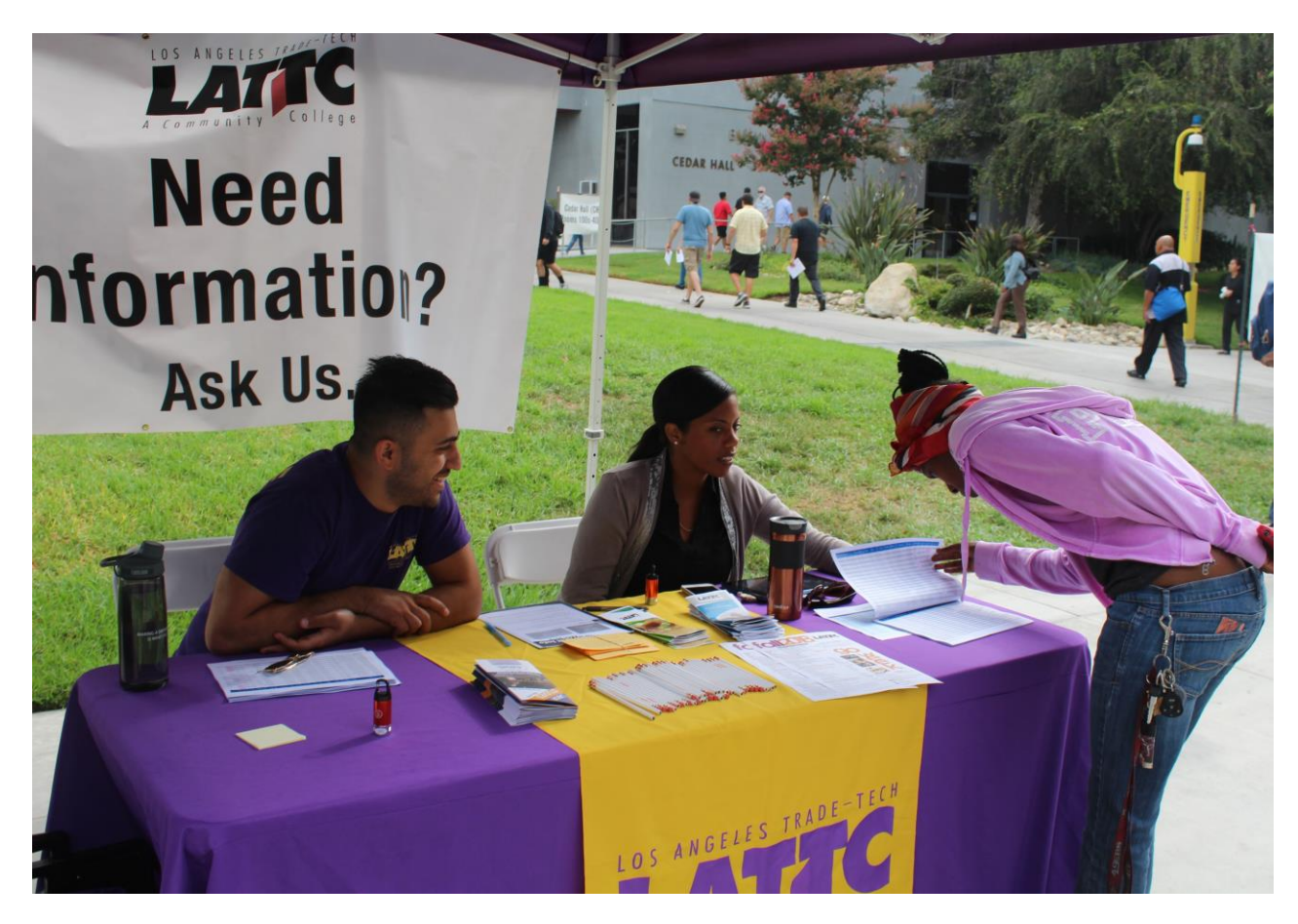
The Info Booth at Los Angeles Trade-Tech did a brisk business during the first week of classes, helping students answer a variety of questions about classes, support services, books, schedules and campus life.